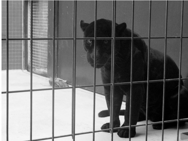
Figure 2: This environment is biologically inappropriate for a panther and could be classified as cruel.