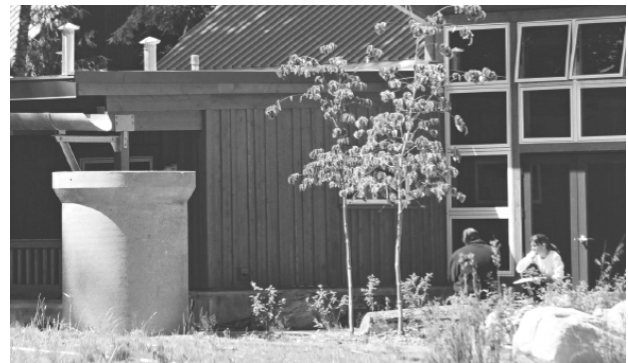
Figure 6: Sitting beside and working in these buildings at the IslandWood School, these people learn primarily with the second mode: experience. They directly experience passive and green building strategies, such as daylighting, natural ventilation, and rainwater catchment.

This mode classifies the learning that occurs with direct experience, such as on a field trip. Beyond observation, this experience is a kinesthetic and emotional process during which learning occurs with stimulus from all senses. Examples of this mode include seeing daylight and feeling cooling breezes in a passive building or smelling blossoms and feeling foliage in a courtyard garden (Figure 6). This mode appeals primarily to motivation by affiliation.