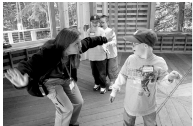
Figure 10: During a lesson, a child experiences a bird's perspective on the forest's canopy while inside a tree house.

The IslandWood School campus includes numerous sustainability strategies ranging from daylighting and natural ventilation to composting toilets and photovoltaic arrays. Many strategies are highlighted and explained with signage. However, the deepest learning occurs as a result of the integration of sustainability strategies into a comprehensive learning environment nestled inside the temperate rainforest. At IslandWood, lessons in ecology or the relationship of humans to the natural environment may involve activities in the greenhouse or living machine. Figure 10 captures a lesson about birds – in a tree house!