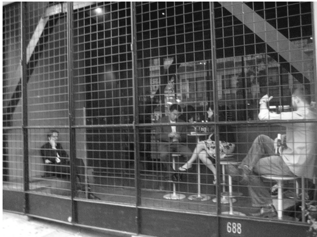
Figure 3: Although this type of environment is common for humans, it may not meet our needs much better, and describes isolation from and control of the environment.

While humans and panthers evolved in similar natural environments, the built environment bears little resemblance to that natural environment. Thus, humans living in the built environment experience physical spaces and stimuli that are different from those to which our species is adapted. Vischer explains that in the extreme, a physical environment can prevent an activity, such as conducting office work while exposed to the rain [13]. More often the built environment does not prevent activities, but instead makes them more difficult, by failing to fully meet human needs. For example, when people work in dreary cubicles with no view to the outside or access to daylight, they are able to continue working, but tend to become relatively unhappy and unmotivated. In these cases, humans manifest this difficulty as stress and decreased efficiency [13].