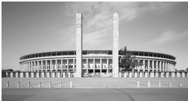
Figure 5: Nazi architecture conveyed the party’s agenda with the use of space and architectural expression.