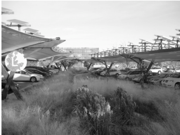
Figure 7: The Desert Living Center uses demonstration and experience to teach sustainable living skills. The facility integrates buildings and exhibits into the biologically diverse Springs Preserve.

The built environment at the Desert Living Center facilitates learning primarily with signs, diagrams, and exhibits. Many of these demonstration strategies work to make visitors aware of elements of the built environment to facilitate learning by experience. Note the schematic diagram applied to the side of a cooling tower in Figure 8. The diagram demonstrates the cooling and humidification of air as it passes through the tower. In addition, the tower is located beside the entrance to the building. Visitors see the diagram as they enter the building and immediately experience to cool flow of air coming from the tower.