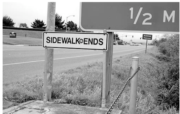
Figure 4: In suburban environments, clean and public transit systems routinely lack connectivity, which reinforces a cultural dependency on automobile transit.

Some lessons taught by the built environment are intentional, however most are not. As an example, consider a typical suburban neighborhood. In such a neighborhood, it is common for sidewalks not to exist or to run only along one side of the road. Frequently bike paths, bike lanes, or sidewalks end abruptly (see Figure 4). These deficiencies in clean transit connectivity usually go almost unnoticed.