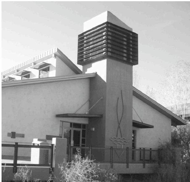
Figure 8: This downdraft cooling tower and pictorial diagram demonstrate a green building strategy and facilitate the visitor's experiential learning.

The built environment at the Desert Living Center facilitates learning primarily with signs, diagrams, and exhibits. Many of these demonstration strategies work to make visitors aware of elements of the built environment to facilitate learning by experience. Note the schematic diagram applied to the side of a cooling tower in Figure 8. The diagram demonstrates the cooling and humidification of air as it passes through the tower. In addition, the tower is located beside the entrance to the building. Visitors see the diagram as they enter the building and immediately experience to cool flow of air coming from the tower.