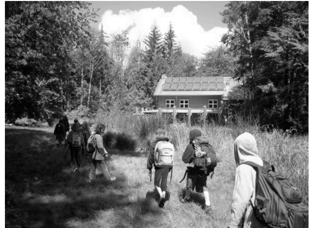
Figure 9: The IslandWood School is a learning environment crafted to facilitate learning through demonstration, experience, and involvement.

Located on Bainbridge Island, Washington, the IslandWood School offers programs for children, graduate students, teachers, families, and adults to inspire lifelong environmental and community stewardship. The school facilities employ all three modes of teaching to convey curriculum and to support other educational programming (Figure 9).